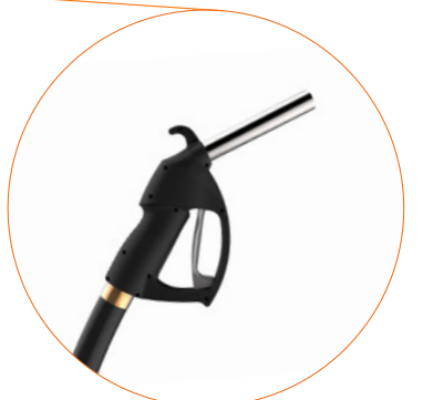
EMPTYING HOSE WITH GUN For emptying liquids