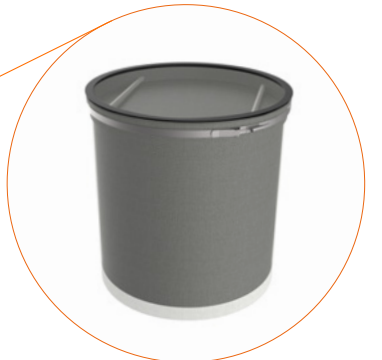
SEPARATING BASKET • Holds the chips • Tank capacity for liquids: 100L • Tank capacity for chips: 60L • Double filtering stage of the basket