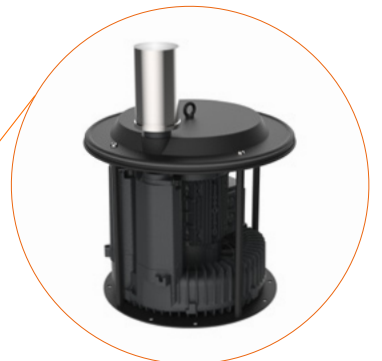
INTERNAL TURBINE Lifting hook for engine inspection